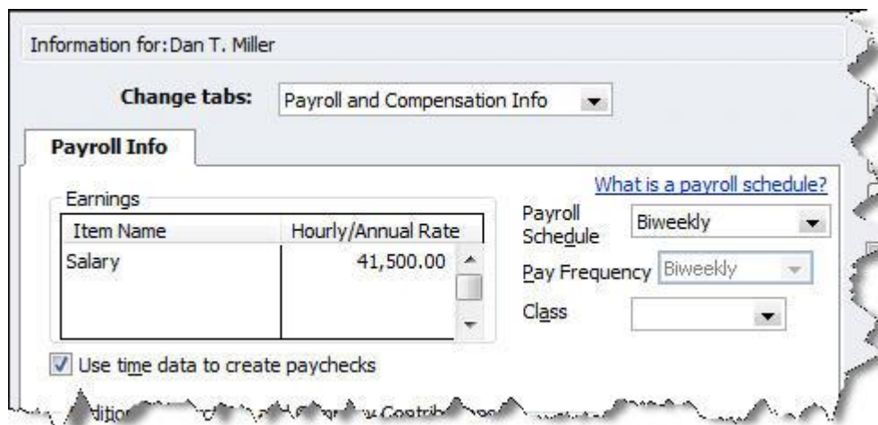
Figure 2: To facilitate the flow from time to paychecks, be sure this box is checked.

Tip: If you want to use payroll to pay employees for time worked, be sure to check the box labeled "Use time data to create paychecks" when you're building employee records as shown in Figure 2 .